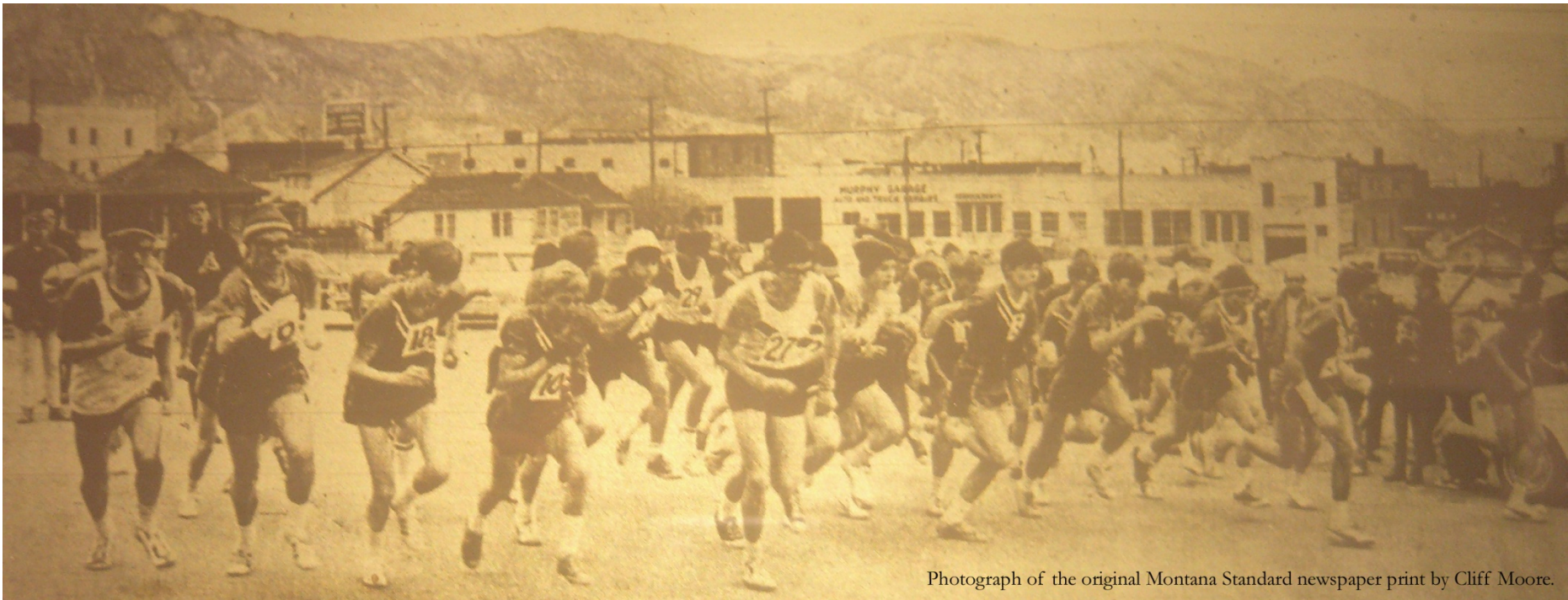
Photograph of the original Montana Standard newspaper print by Cliff Moore.

Wednesday, 11 Nov 1970 at Naranche Stadium