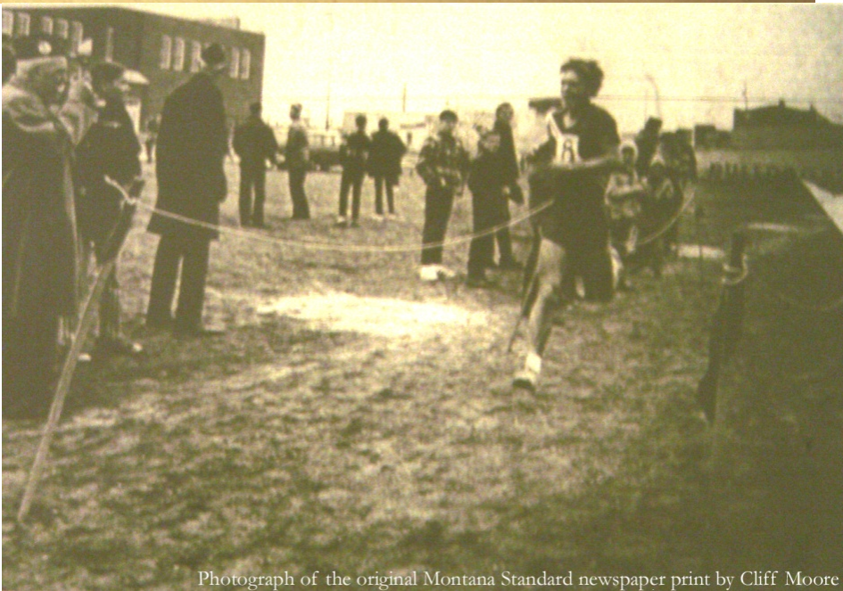
Photograph of the original Montana Standard newspaper print