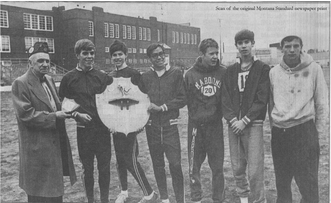
Scan of the original Montana Standard newspaper print