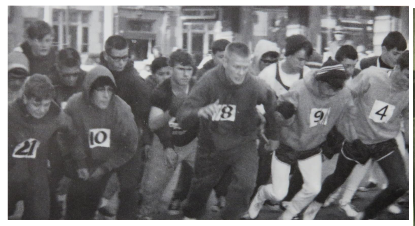
Friday, 11 Nov 1966 at Legion Hall in Uptown Butte - Avoiding the Pit