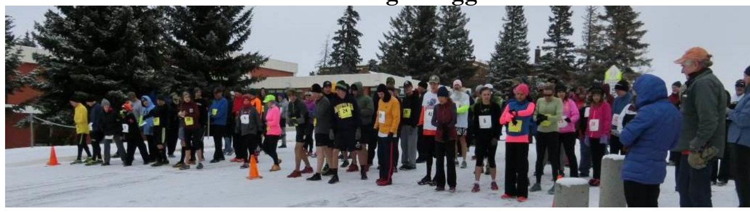
Saturday, 21 February.