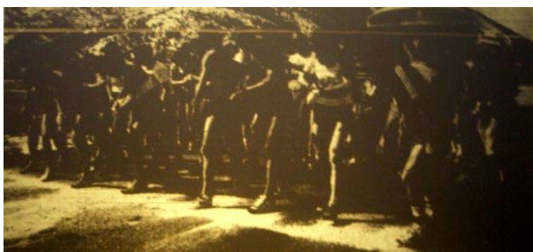
Runners set to start the AOH St. Pat's 6 mile.